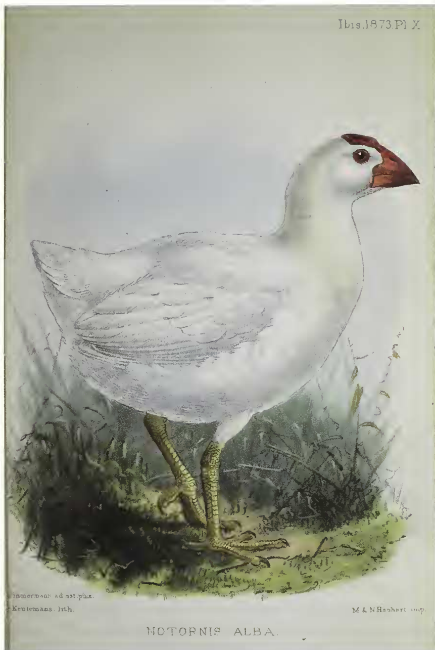
Figure 10. Illustration of a Takahe-like Lord Howe Gallinule Notornis alba in Salvin (1873) by J. G. Keulemans, based on a sketch provided by Pelzeln of the Vienna specimen

Gallinule ( Fulica ) alba ); New Zealand, rare; brought by Sir J. Banks'. The specimen was purchased by Lord Stanley and, along with his Knowsley collection, bequeathed to the people of Liverpool and finally donated to the free public museums of Liverpool by the 13th Lord Derby around 1850 (Rowley 1875, Forbes 1901).